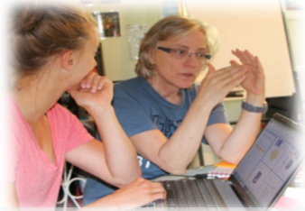
Online or onsite live one-on-one coaching

Acquire full competence in Usability Mapping® with UMAP IT®.